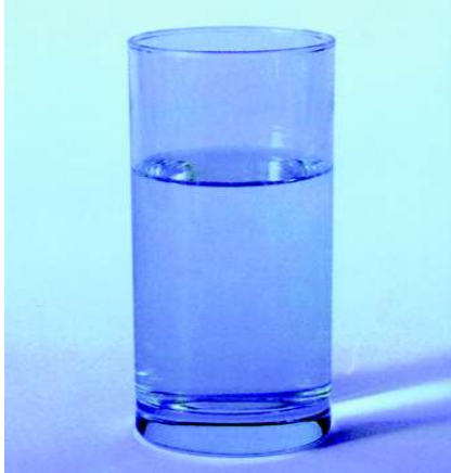
Just a glass of water! But without water we have no life. It deserves all of our respect and gratitude.

You need a balanced vegetable and protein diet, a ratio of 20 to 80, 80 percent vegetables and fruits, not very much starch, and 20 percent protein. Do this and take the right amounts of water and cut out sodas, I can assure you, I guarantee no disease will occur in you for a long time. You need your water before your food. First thing in the morning when you wake up, two glasses of water to offset the dehydration of overnight. Then you need a glass of water half an hour before food because if you expect to digest the food, you better give the water beforehand. You need also a glass of water two-and-a-half hours after food, to wrap up the process of digestion, and hydrate the areas that lost water to the circulation. You need for every quart or liter of water a quarter teaspoon of salt, you also need the other minerals in order to regulate the volume of water that is held inside the cells. You need a balanced protein: eggs are very good, cottage cheese is excellent, to give