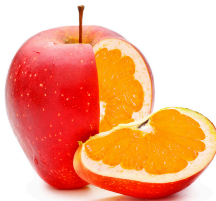
Fig. 1: Some people say that GMO stands for ‘God Move Over’. Here’s an example of man acting like God.

So are GMOs really dangerous for human beings, for animals, and for nature, especially for plants, soil and water? Read on for an overview of Genetically Modified Organisms; the state of our food today; and what you can do about it to ensure that your family, friends and pets are safe from this silent invasion.