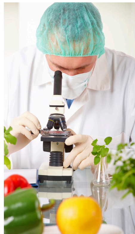
Fig. 2: The insertion of the new gene is fired into the DNA of the plant seed by a type of gene gun. The resulting DNA behaviour of the plant is unpredictable and unknown, because it is a completely new organism to this planet.

Cross-pollination: If you are an organic farmer and your crops are cross pollinated by a GM crop, then the Biotech company is able to force the farmer to buy their seeds and pesticides; 27 because effectively the farmer is now using their GE patented product! In this way the Biotech companies are trying to patent nature!