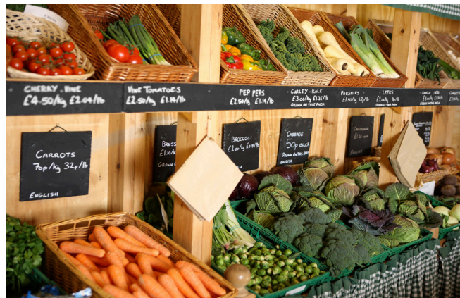
Fig. 4: Grow your own produce or support your local and organic farmers.