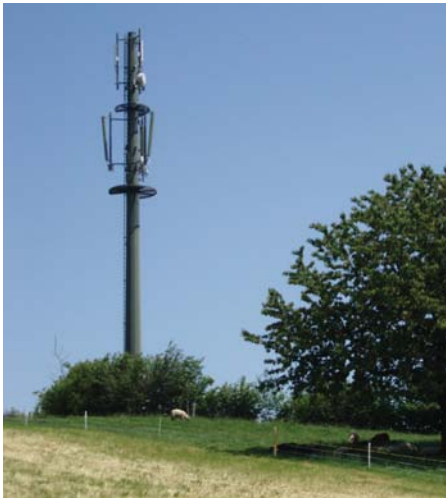
The dangers of mobile phone systems are still being played down, while mankind and nature are subject to a field test, the consequences of which will be devastating if we do not do something about it.