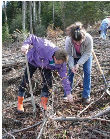
Young and old are very active in planting trees.

to the official Arbour Day on 25th April 2008. Afterwards, the Organic Hotel 'Eichberg' in Seengen treated us to a delicious meal.