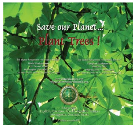
Our beautiful presentation "Plant Trees", accompanied by music, shows how essential the trees are for life on Earth.